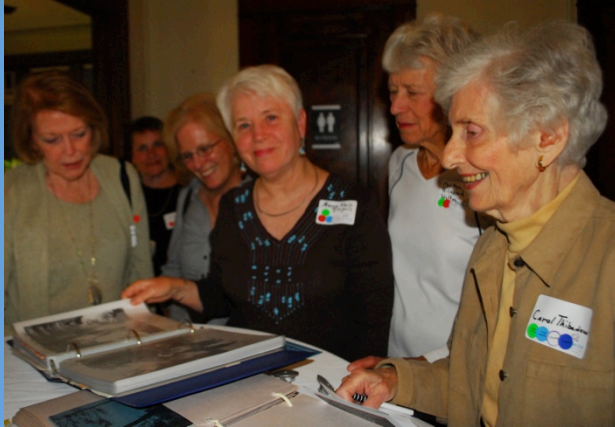
The Centennial Celebration took place October 9, 2010 at the Houston Mill House in Atlanta.

2010 marked the 100 th birthday for Camp Fire USA and the 87 th year for our own Georgia Council! Past and present club members, alumni, staff and friends of Camp Fire USA Georgia Council gathered together to celebrate the national organization's centennial year.